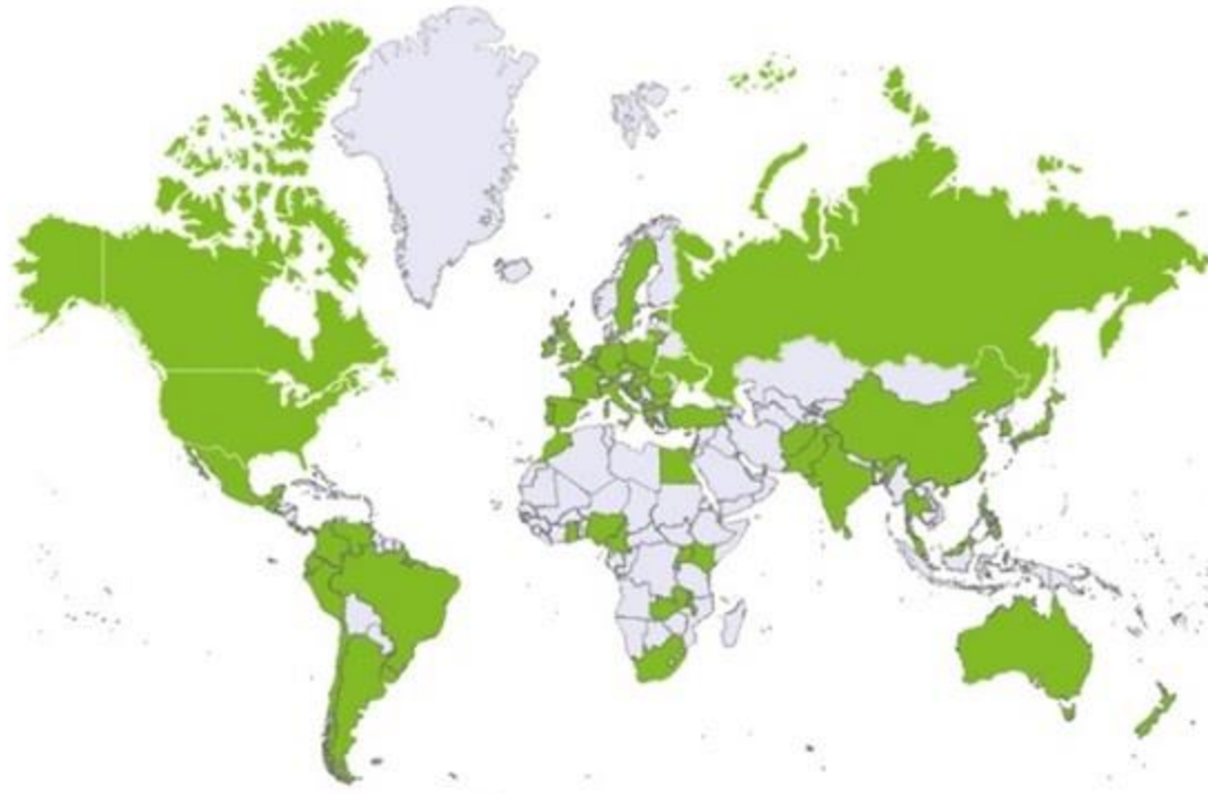
■ Countries where IAP0 has members (June 2016)